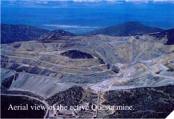
Aerial view of the active Questa mine.

"Chevron's project is a great example of building renewable energy on disturbed lands, a fantastic way to utilize waste land by using our polluted past to get to our clean future." – Zoe Krasney, The Wilderness Society, Albuquerque