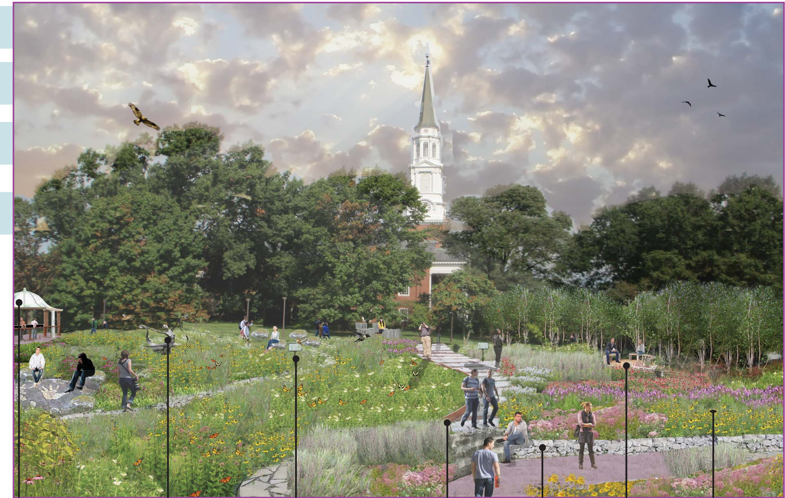
Overlook Structure and Signage | Interpretive Signage | Terrace Access | Recycled Stone Wall | Meditation Garden | Wet Meadow