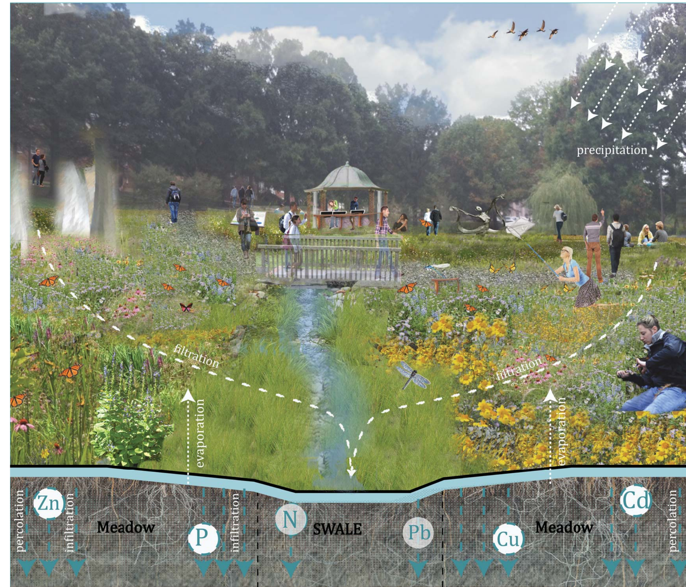
MEADOW SPONGE: uptake of pollutant runoff and for providing pollinator habitat