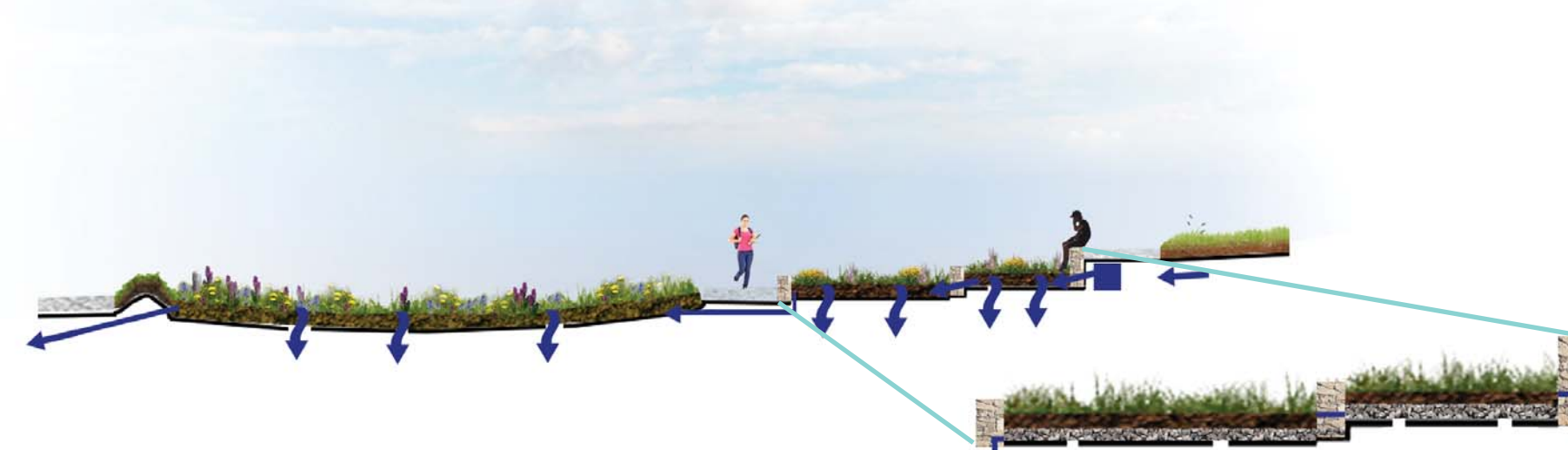
The stormwater terraces and wet meadow act as an infiltration basin and bioretention while supporting a niche ecosystem not typically found on campus