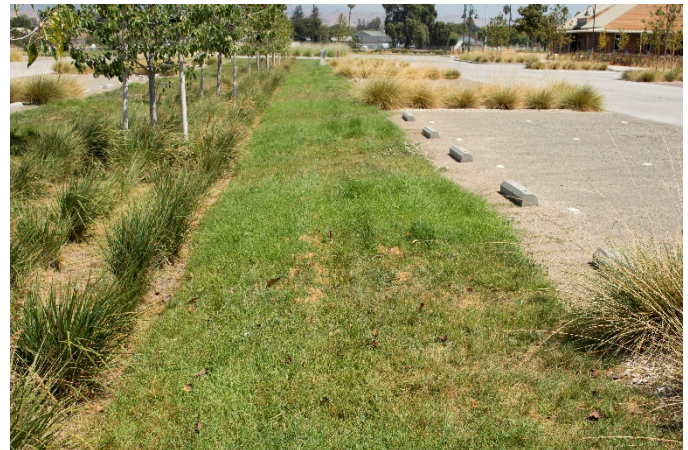
A parking lot designed with green infrastructure, vegetated buffers, and alternative surfaces can improve the quality of stormwater from the parking lot.

The most straightforward green parking strategy is to right-size the number of parking spaces, ensuring that there are enough spaces for the intended uses. Parking lots typically have far more spaces than necessary. By right-sizing parking, planners, developers and the community can ensure that there is enough parking without creating unnecessary impervious surface. The problem of too much parking results from designing parking ratios around the highest hourly parking needs during peak seasons—a common practice in parking lot design. Designing to average demand, as opposed to the peak demand, results in fewer spaces and less