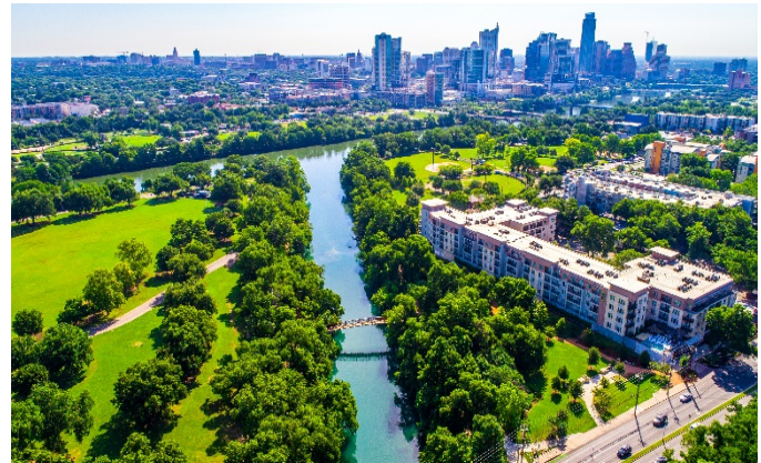
Riparian forested buffers can reduce pollution in stormwater from urban landscapes.

Buffers are applicable to new development and redevelopment areas. For new development areas, planners can incorporate buffers through the designation of specific preservation areas. These areas can be managed through long-term easements or by community associations. For existing developed areas, an easement to the property of adjoining landowners may be necessary. A local ordinance, such as Kansas City's stream setback ordinance (Brown et al., 2009), can help set specific criteria for buffers to achieve stormwater management or other community goals.