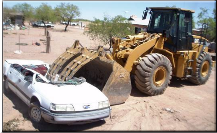
Vehicle collection by the Tohono O'odham Nation. The Tribe owns the equipment to collect the vehicle from where it was abandoned and transport it to a centralized storage area.