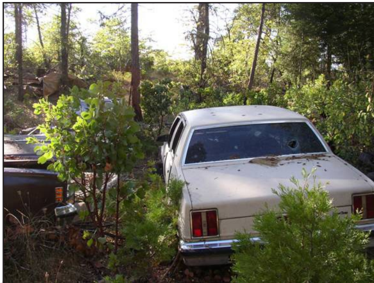
Abandoned vehicle on tribal land

To initiate a successful program, the tribal government should work closely with the community and provide information on the environmental, health, and other hazards associated with abandoned vehicles.