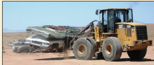
Vehicles are sorted