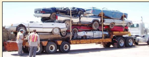
Vehicles being transported to the metals recycler/purchaser