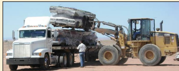
Stacked on a transport vehicle