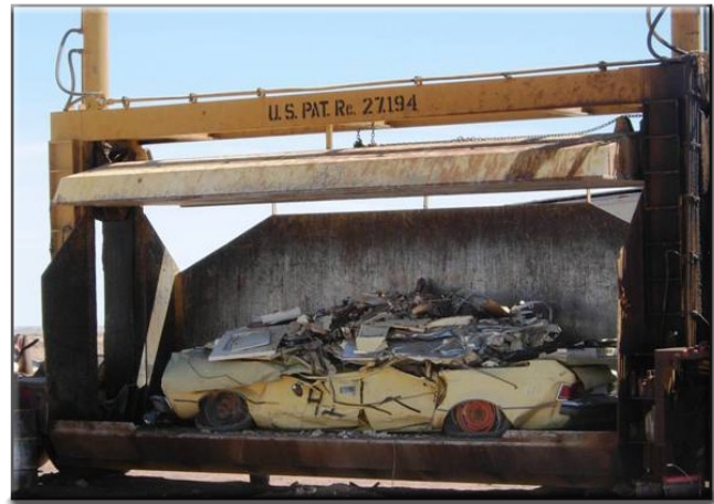
Vehicle crushing by the Hopi Tribe. The crusher is contracted by the Tribe and arrives to crush vehicles collected in a centralized location. To reduce cleanup needs crushing should take place over drip pads or other absorbent material.