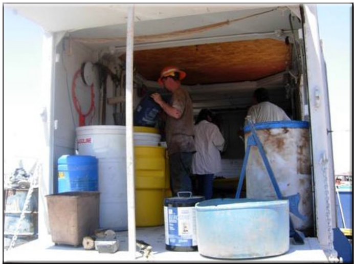
Fluid collection at the Hopi Tribe. The tribe subcontracts all activities to prepare the vehicles for crushing. Fluids are removed from the vehicle and placed into secondary containers. Anti-freeze and oil are recycled. Mercury switches are handled and disposed of as hazardous waste. Gasoline is disposed of by an environmental waste management service.