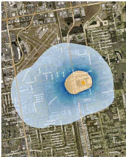
EPA Modeled Risk Map— BEFORE installation of air pollution control devices