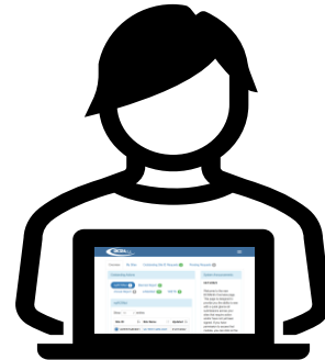
Registered Remote Signer