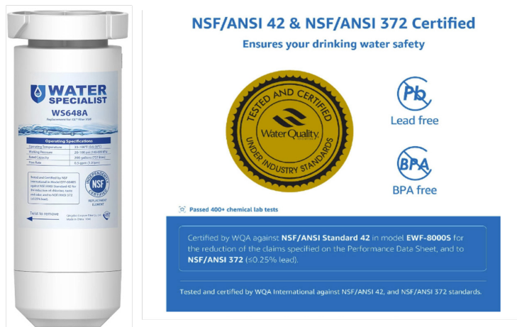
Figure 2: Example Certification Marks on Water Treatment Products

Prices of water treatment systems and installation vary depending on the type of technology used, where the unit is installed, and what contaminants it removes. Basic water pitchers and tap filters typically cost less than $100 and require no installation,